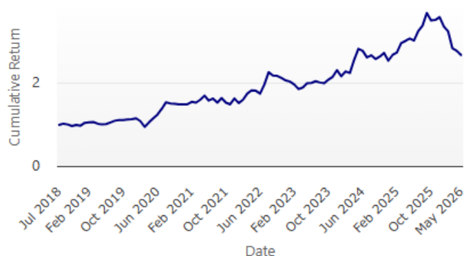
Datt Capital Absolute Return Fund Cumulative Return